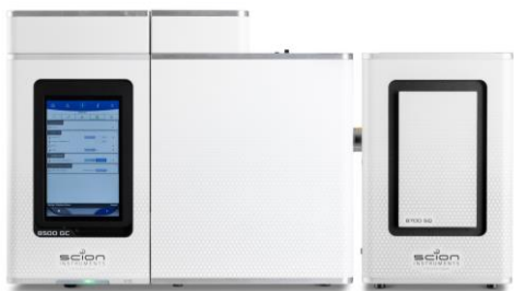
Figure 1. SCION Instruments 8500 GC coupled with the 8700 MS(SQ).

This application note details the determination of PBBS and PBDEs using a Scion 8500 gas chromatograph coupled with the Scion 8700 Single Quad Mass Spectrometer. The instrument could be visualized in the Figure below (Figure 1).