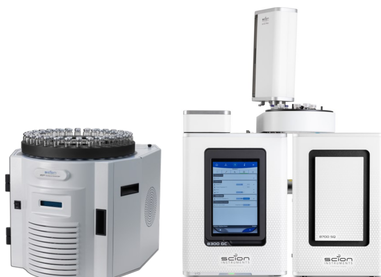
Figure 1. SCION HT3 Headspace Sampler together with the SCION Instruments 8300 GC platform in combination with to 8700 SQ-MS equipped with 8400PRO autosampler .

This application note will demonstrate the versatility of SCION Instruments HT3 and Versa Automated Headspace Analyzers for determining dissolved gases in ground water samples. Methane, ethene, ethane, and propane were evaluated.