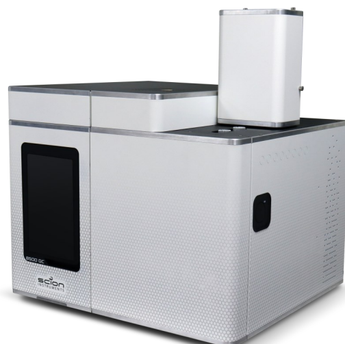
Figure 1. The SCION Instruments 8500 GC Hydrogen analyser

Figure 1 shows the SCION Instruments 8500 GC hydrogen analyser using a FID as detector. This application is also applicable on the SCION Instruments 456-GC.