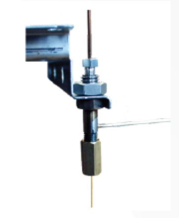
Fig 1. SCION mini gas splitter

At SCION Instruments we take great care in designing such analytical solutions. By making use of inert material, deactivated steel transfer tubes and fused silica separation column and avoiding large volumes in the sample path we reduce all adsorption sites in the sample flow path to deliver the highest level of sample transfer to the detector. Figure 1 shows the mini gas splitter used to improve analytical accuracy.